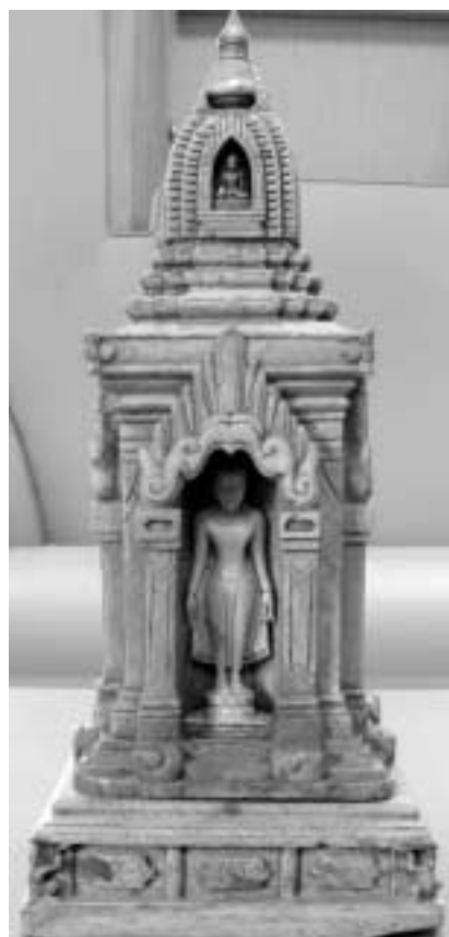
Fig. 23 Four-faced shrine, 32 x 14.5 x 14.5 cm

and appear as a proper Burmese creation; in those images, the Buddha has the right hand falling at his side whereas the left one is put flat on the chest. 25) In the group presently under study, the images reproduce gestures traditionally presented by the Buddha whatever his dress, royal or monachal, i.e. he calls forward the earth, he meditates, he gives. A standing image, however, comes closer to the group of wooden carvings; wearing an elaborated girdle with broad beaded arches and loops hanging on both legs, a necklace elegantly knotted in the back and a tiara, the Buddha puts the right hand flat on the chest (Fig. 16).