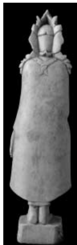
Fig. 15a-b Standing Buddha showing abhayamudrā , 18.5 (with pedestal) / 16.1 (without pedestal) x 5,5 cm (largest width at level of robe). See also Figs. 3 & 7