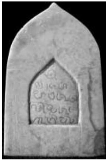
Fig. 5a-b The Enlightenment , 4.1 x 2.7 cm