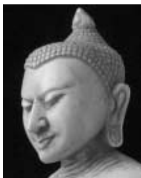
Fig. 7 Detail of Fig. 15