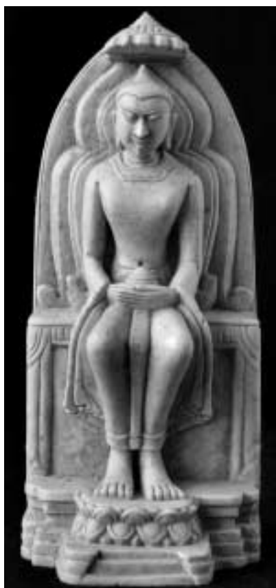
Fig. 21 The Buddha seated in the 'European way', holding his alms bowl, 9.8 x 4.3 cm. See Figs. 2 & 14