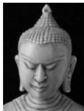
Fig. 10 Detail of Fig. 22

a feature that will be emphasized in the following centuries. 19) Similarly, the wooden, metal or/and stone images distributed in the Shwezigon, Ananda, Naga-yon and Kyauk-ku-umin, as well as all 'andagū' images studied in the present paper, show the head with pointed chin clearly put above the neck adorned with three incised lines. As to the 'short neck' Buddha which is encountered in sculpture (stucco images in shrines; 'andagū' and cast images) and in the murals of the site, it emerged in the course of the 12 th century as a local development. 20)