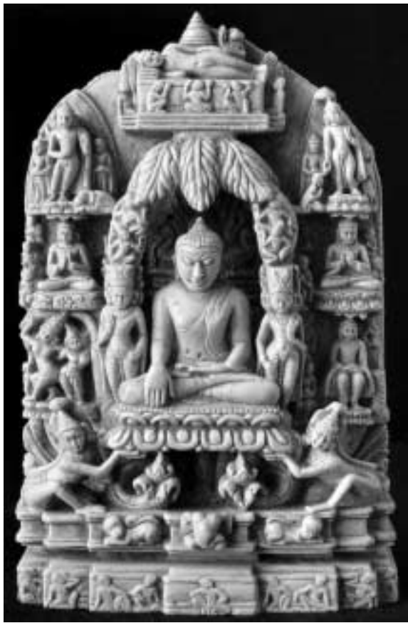
Fig. 19 The 'Eight Great Events', 11.2 x 7.1 cm. See also Fig. 6