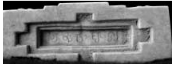
Fig. 2 Lower surface of the pedestal below the image illustrated in Fig. 21

A fairly large number of these images bear inscriptions distributed in the lower part, i.e. on the front or/and sides of the pedestal (Fig. 14b), on the lower surface of the sculpture, or on the back (Figs. 2-3, 5b). While the work of deciphering these inscriptions is still in progress, one cannot exclude the possibility that some reproduce yantras similar to those integrated in Buddha images of