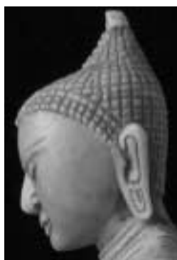
Fig. 8 Detail of Fig. 22