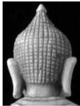
Fig. 11 Detail of Fig. 1 Fig. 12 Detail of Fig. 14 Fig. 13 Detail of Fig. 22

clearly drawn through straight lines, and, when seen in profile, is straight with its tip rounded or slightly curved. The lower lip is thick, the upper one very thin; their corners are drawn upwards. Seen from the front, the lines of the upper lips and of the eye-brows can be parallel; or the lower full lip can follow the line of the pointed chin. Moreover, the eyeballs are directed downwards, hidden by the upper lid, which makes them practically invisible when seen from the front and possibly creates a thick dark line. The hairline is bow-shaped and parallel to the eye-brows.