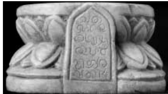
Fig. 3 Rear side of the lotus pedestal seen below the image of Fig. 15