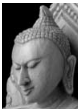
Fig. 9 Detail of a standing Buddha 'walking', 15.4 cm x 5 cm