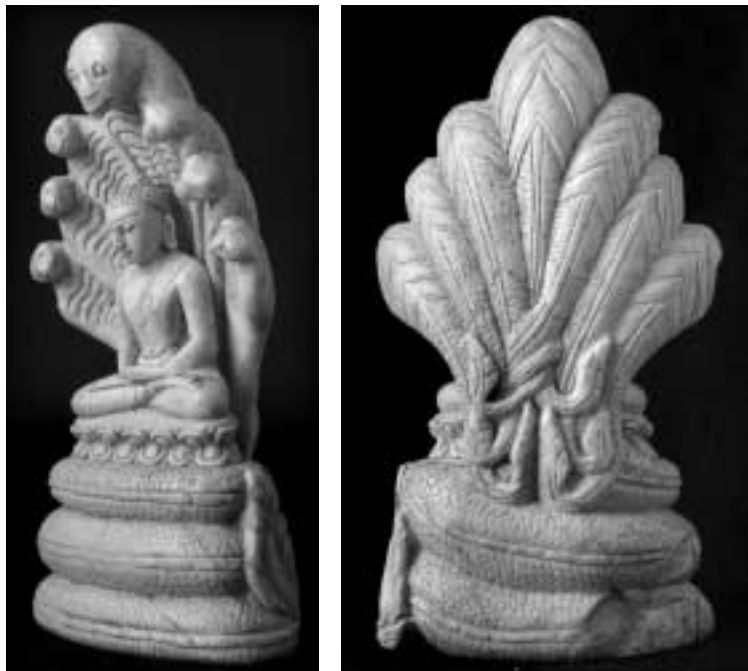
Fig. 4a-b The Buddha seated below Mucilinda, total size: 9 x 4.7 cm

North Thailand. 15) These inscriptions can be incised in a frame clearly shaped or drawn on the un-carved surface of the lotus pedestal: as a matter of fact, in the seven images of the seated Buddha which are carved in the round, the lotus-seat is not represented all around, but a plain space of varying width is reserved in the central part of the lotus in the back of the image, probably