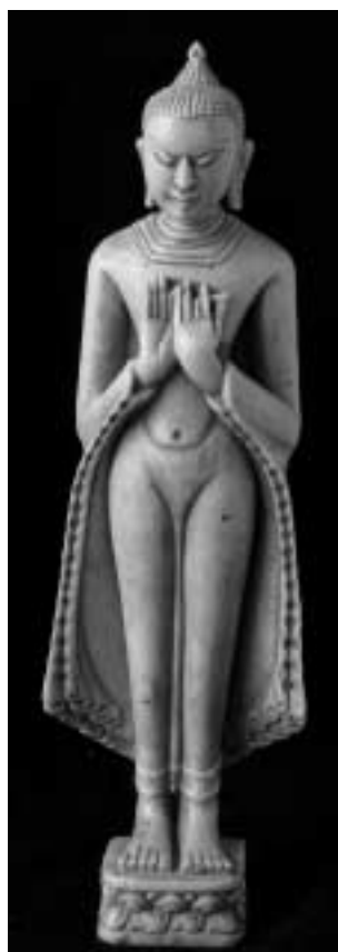
Fig. 22 Standing Buddha displaying the gesture of teaching, 14 x 4.5 cm; pedestal: 2.2 x 2.5 cm. See Figs. 8, 10 & 13