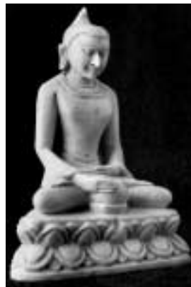
Fig. 20 The Buddha taking food, 5.1 x 3.7 cm