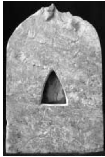
Fig. 6 Rear view of Fig. 19

a back-slab and sits/stands above a lotus lying above a plain pedestal; the back of the image can be smooth (Figs. 5b-6) or remains unpolished. Like in India, in the 11 th and 12 th centuries, an opening can be carved through in the back, allowing seeing the Buddha's back (Fig. 6). A number of images are carved in the round, which lets suggest that they might have been part of a composition as mentioned above.