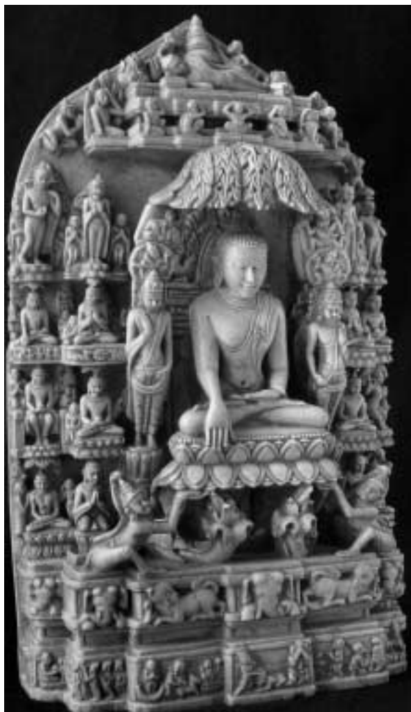
Fig. 1 The Enlightenment, surrounded by further scenes of the Buddha's life, including the 'Great Events' and the 'Stations', 20.2 x 12.2 x 4.7 cm

Loka-hteik-pan. 10) In those monuments, the stucco image of the shrine (with bhūmisparśa-mudrā , i.e. symbolizing the Enlightenment at Bodhgaya) and the murals painted on the wall behind this image (and illustrating seven further events of the Buddha's life) are combined in a single composition.